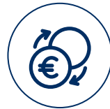
Consumers and retail customers