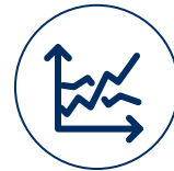
Investors and capital market participants